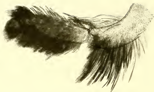
Fig. 1. Visiana robinsoni , male palp.

a comprehensive revision of the genus Visiana based on adult and genitalic morphology which is currently in progress (Schmidt, unpublished data).